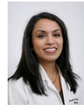
Executive Committee Member