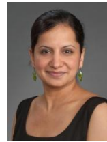
Executive Committee Member